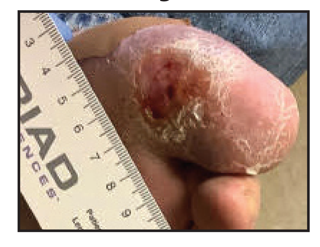
Healed with two weekly treatments